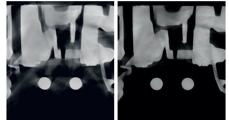
Improving image quality: Cone-beam CT without (left) and with ScatterFix 2.0 (right).

To support the Comet Yxlon CTScan3 line detector, we developed the first ever collimator for an LDA. It reduces scatter radiation already during the fan-beam scan.