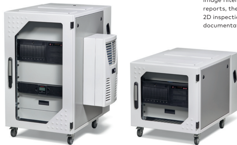
For the evaluation of your data you can choose between workstations in 19" racks with a cooling fan for laboratory environments (right) or air-conditioning for IP54 class protection in industrial conditions (left).

Fluoroscopic examinations are possible due to the manipulation of the test part using joysticks and the sideways movement of the flat-panel detector. With the touch of a button, you can benefit from numerous digital 2D live-image filters, automatic 2D inspection reports, the possibility of predefined 2D inspection sequences, and the documentation of inspection decisions.