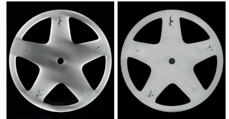
Eliminating unwanted gray-value gradients: Cone-beam CT without (left) and with Beam Hardening Correction (right).