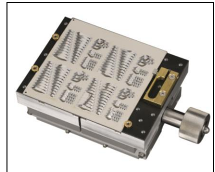
4x4" workholder with . rubberized surface and mechanical clamping