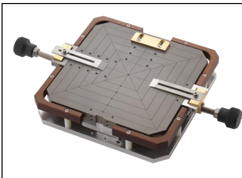
6x6" workholder with Vacuum and mechanical clamping