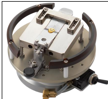
TO Workholder with mechanical clamping