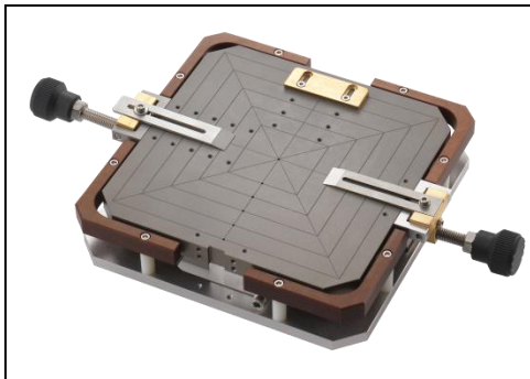
6 x6" workholder with Vacuum and mechanical clamping