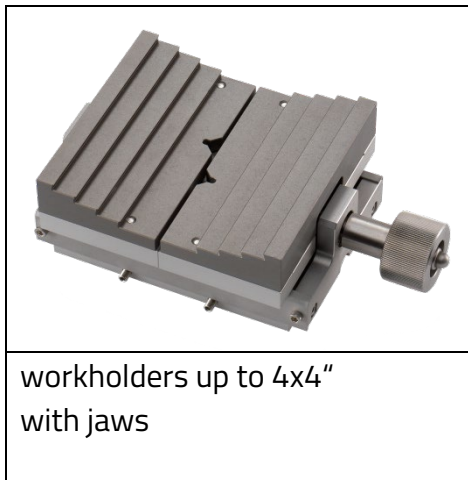
workholders up to 4x4" with jaws