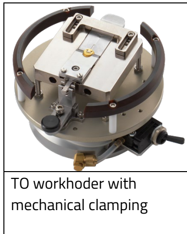
TO workholder with mechanical clamping